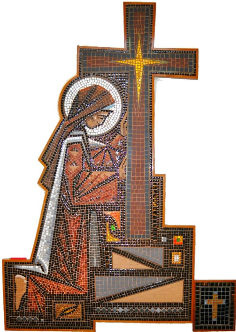
Contractor for Hickmott and Hamptons, memorial and general stone masons, designed the mosaics, installed by Hickmotts from pre-1967.