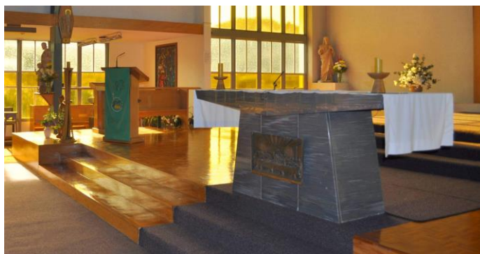
The Altar and Sanctuary St Teresa's Karori, present day.