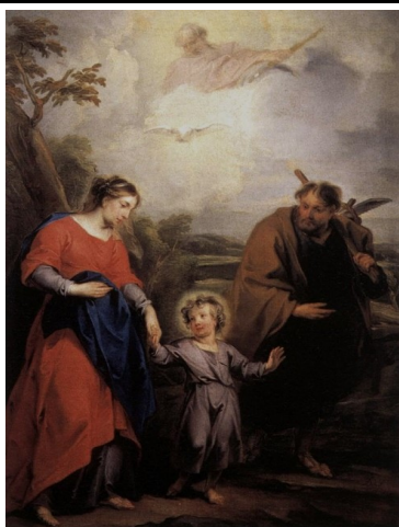
Jacob de Wit, 1723 Earthly and Heavenly Trinity

When I used to prepare Children's Liturgy for Trinity Sunday, I would often reach for a visual aid to explain the "mystery" of the Trinity: a three-leaf clover, three strands plaited into one, or three coloured liquids blending together. They were helpful for children, but as I reflect on this feast now, I realise the Trinity is less about explanation and more about Relationship ; Something we glimpse not only in symbols, but in the way love is lived. God, whom we name Father, Mother and Creator, invites every person on earth into a loving relationship with him and with each other. Trinity Sunday celebrates a God of tenderness, compassion, and love. In the first reading, Moses encounters "a God merciful and gracious, slow to anger, and abounding in steadfast love." In John's Gospel, we hear that "God loved the world so much that he gave his only Son... in order that the world might be saved through him." Jesus shows us what love looks like in action: solidarity with the poor, courage in confronting injustice, and a selfless life poured out for others. Last weekend at Pentecost we heard about the Spirit described as the bond of love between the Father and the Son. The Spirit is God's active presence among us, empowering us to work with joy and hope for justice, reconciliation, and peace. The Trinity is a living pattern for how we are called to relate: three Persons in a Community of Love .