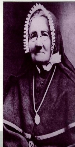
MOTHER MARY AUBERT